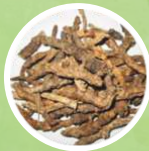
Picrorhiza Kurroa Extract