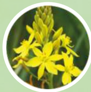
Bulbine Natalensis Powder Extract