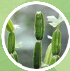
Cissus Quadrangularis Extract