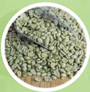
Green Coffee Beans Extract