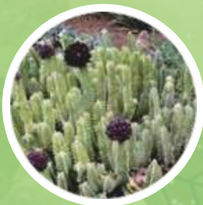
Caralluma Powder Extract