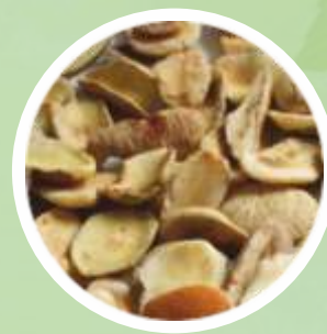
Irvingia Gabonensis Extract