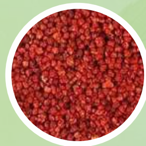
Colchicine USP/BP DMF Number 032072