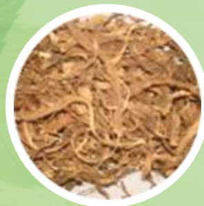
Coleus Forskohlii Extract