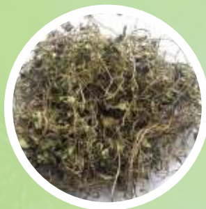
Bacopa monnieri Extract