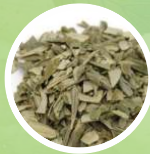
Olive Leaf Extract