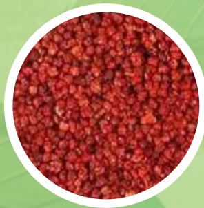
Thiocolchicoside IP/EP DMF Number 032070