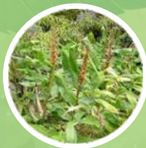
Fadogia Agrestis Extract