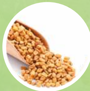
Fenugreek Seed Extract