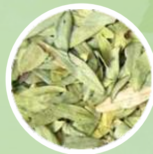
Calcium Sennosides DMF Number 032164